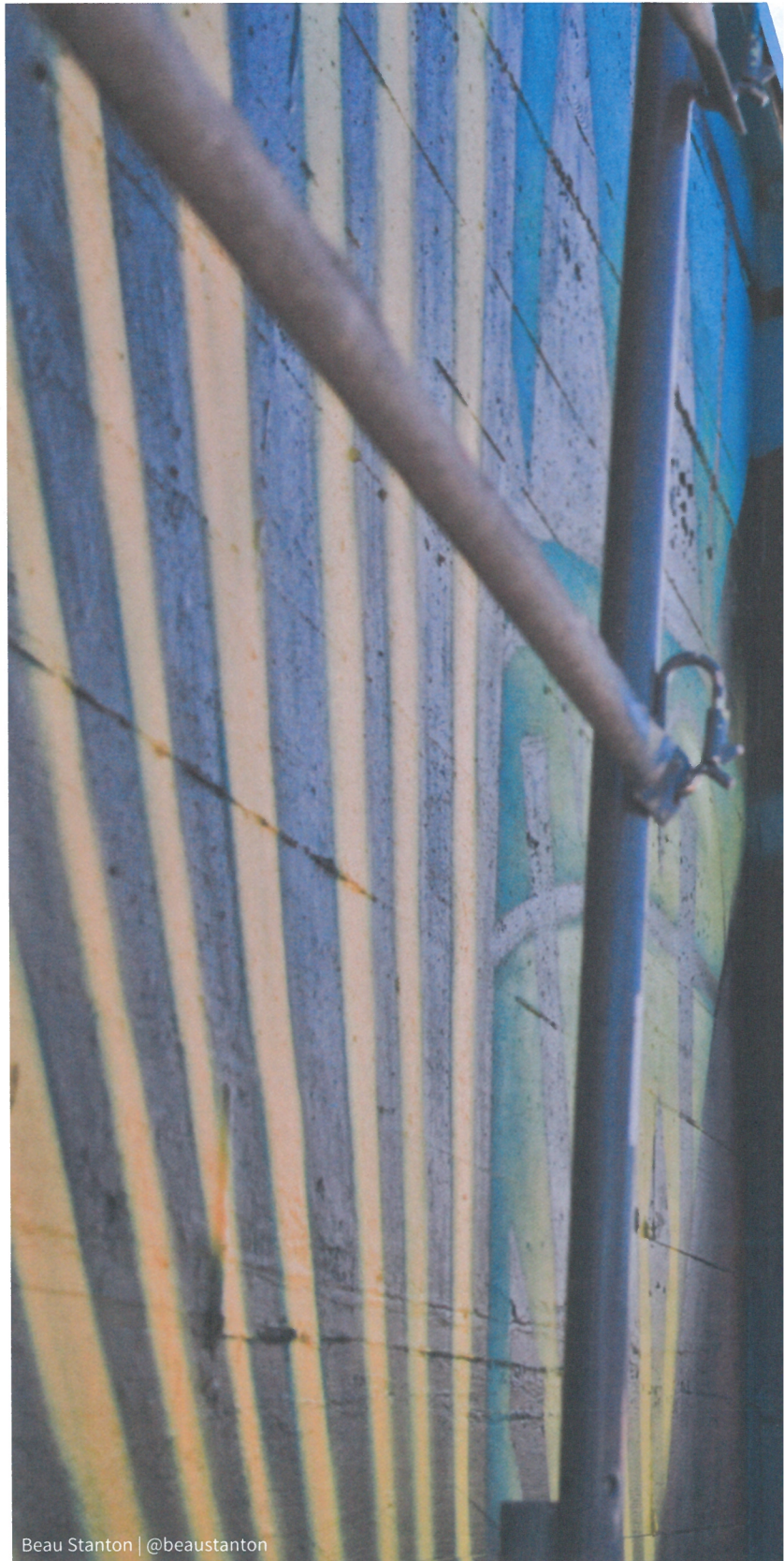
Beau Stanton | @beaustanton