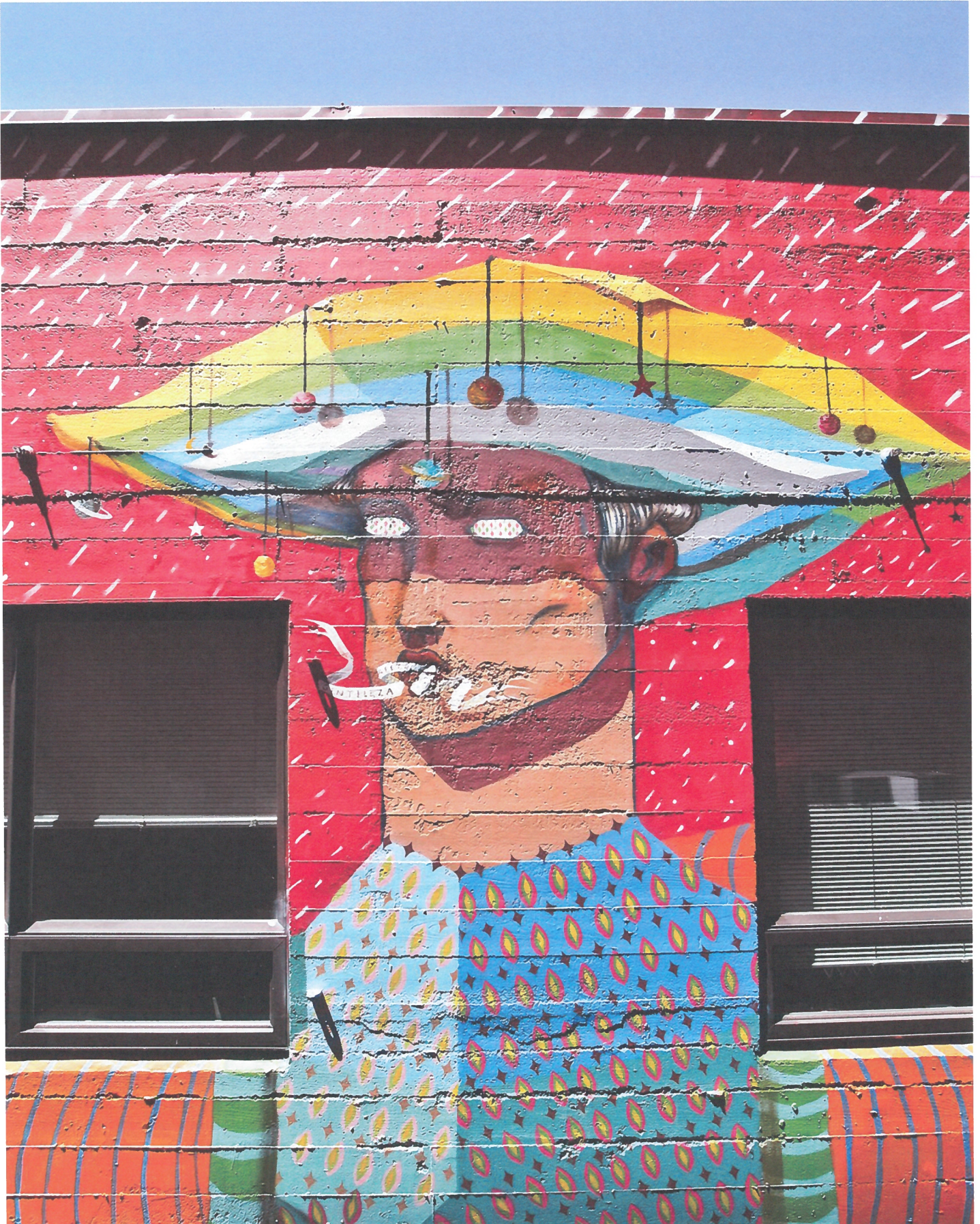
“Sidewalk Games (and Kindness)” - “Jogo de Calçada (e Gentilezas)”